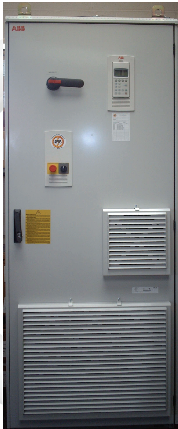
APDS 400kW IP54 Inverter

Rapid delivery, installation and commissioning form part of the APDS offering.